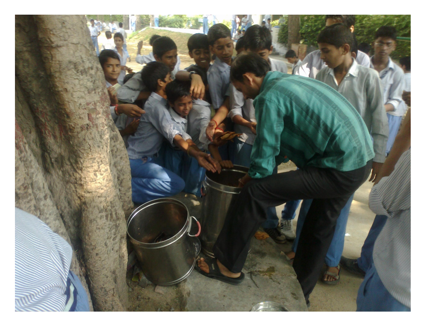
DAV Sr. Sec. School West Patel Nagar, New Delhi