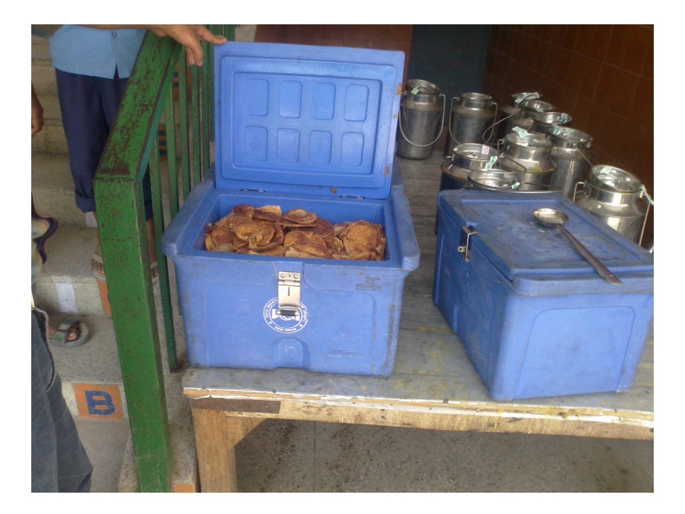
MC Boys Primary School Mahavir Enclave, Part 2/3, New Delhi